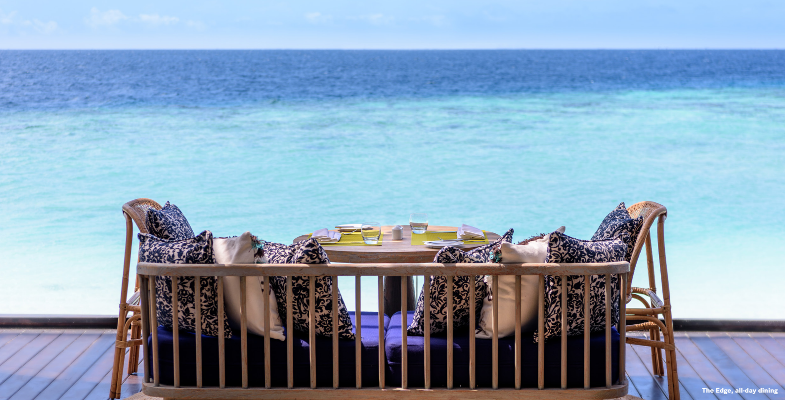
The Edge, all-day dining