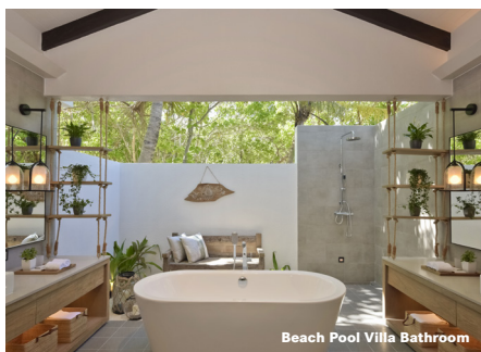
Beach Pool Villa Bathroom