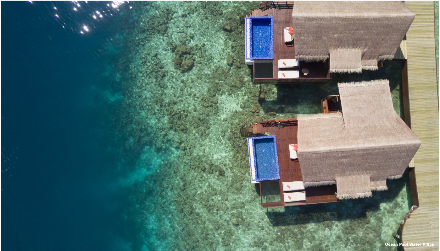
Ocean Pool Water Villas