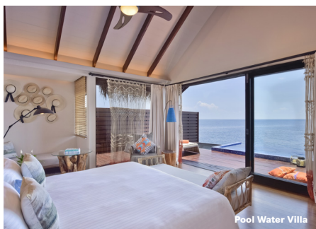
Pool Water Villa

Choose from a variety of 120 beach, ocean and overwater villas that come with spectacular ocean and lagoon views. The Grand Residence featuring two bedrooms and a living room is designed for the ultimate luxurious experience.