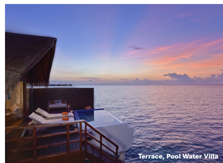
Terrace, Pool Water Villa

Wake up to the beautiful view at your private ocean water villa, located near the island facilities and offers limitless views of the sky and sea. Also features a private terrace with sun lounger, inviting steps to the underwater world as well as an expansive bathroom with indoor and outdoor shower.