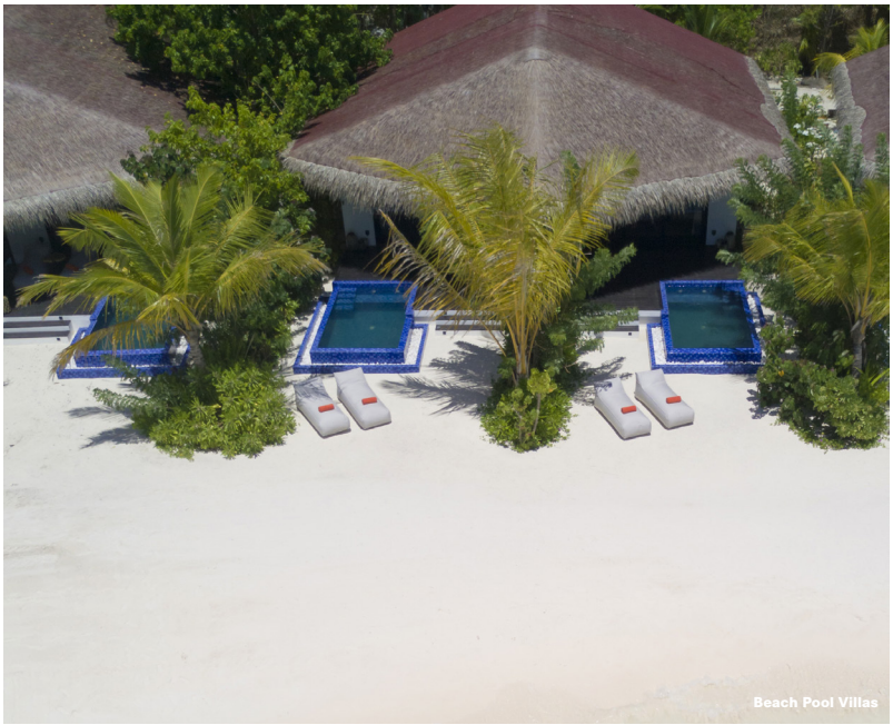
Beach Pool Villas