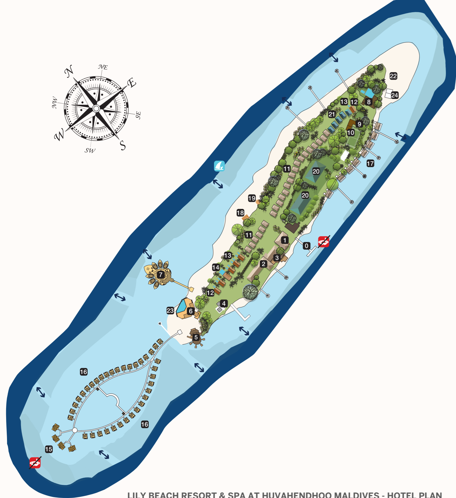
LILY BEACH RESORT & SPA AT HUVAHENDHOO MALDIVES - HOTEL PLAN